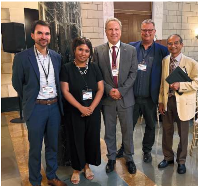
National Academies meeting in Washington DC