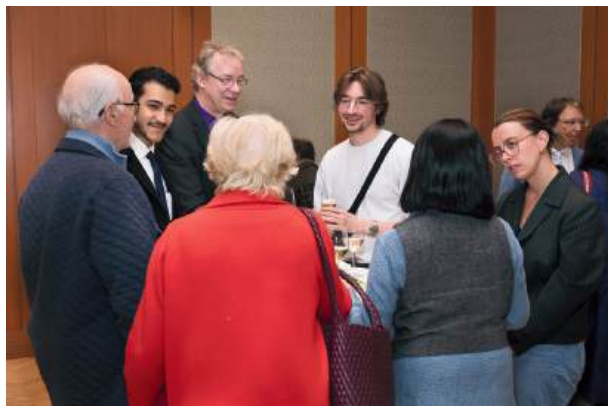
UA Ruhr Science Symposium - Artificial Intelligence and the Philosophy of Perception