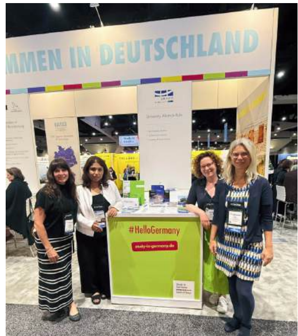
NAFSA Conference 2025 in San Diego

UA Ruhr participated in the NAFSA Conference held in San Diego. The conference remains the platform to strengthen UA Ruhr's long-standing partnerships. On May 28, UA Ruhr hosted our annual reception to engage with our valuable partners.