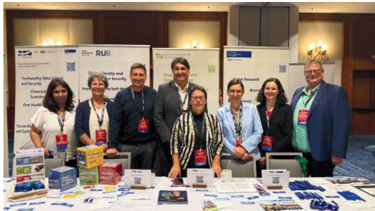
UA Ruhr at GAIN 2025