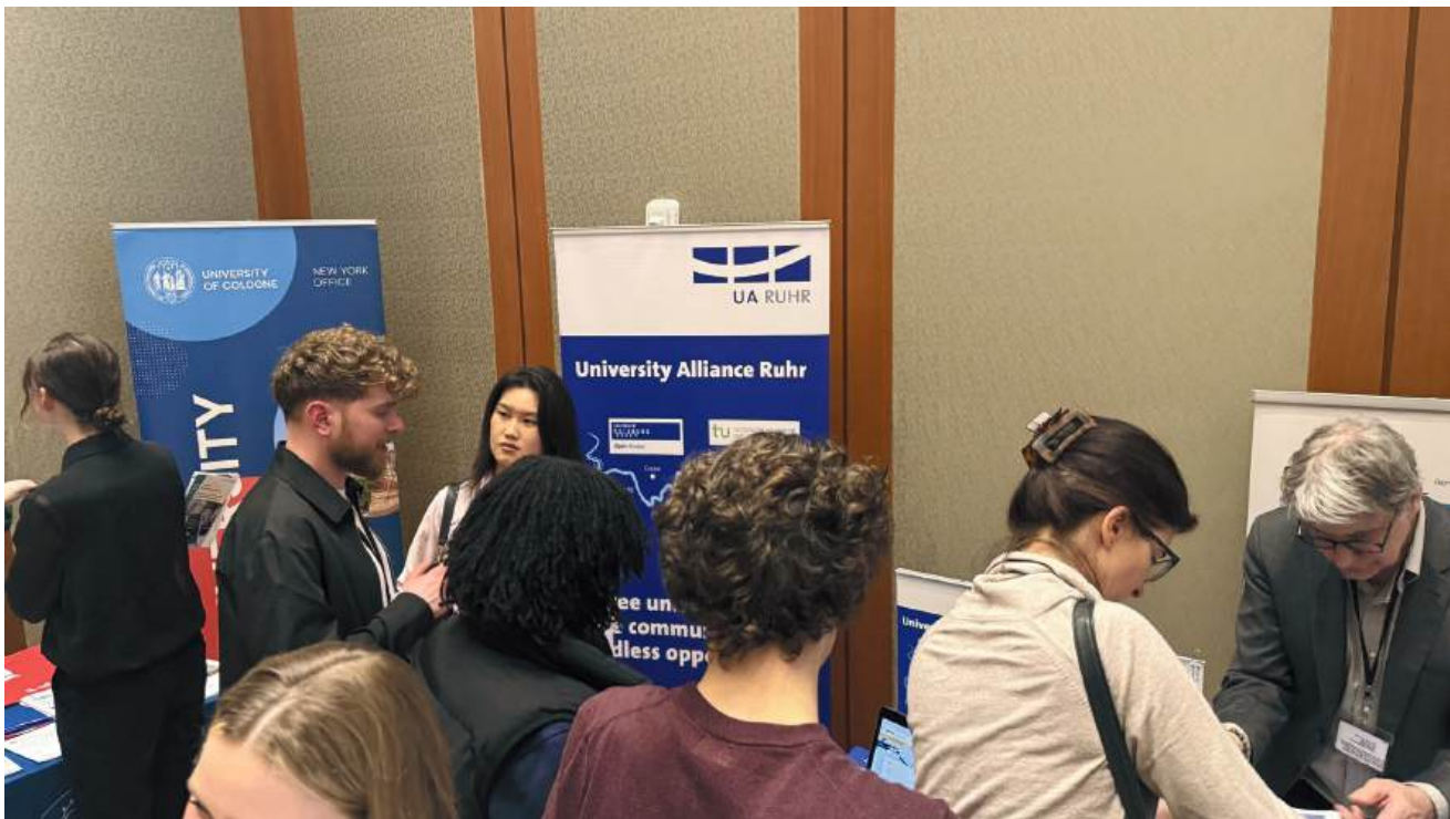
UA Ruhr at the Germany Grad Fair 2025

The event allowed attendees to connect with representatives from German universities, funding agencies, and cultural institutions. Students and young professionals gained valuable insights to help them make informed decisions about the academic programs and universities best suited to their goals. Participants also learned about the application process and degree requirements. UA Ruhr truly enjoyed meeting so many enthusiastic and curious participants at the fair.