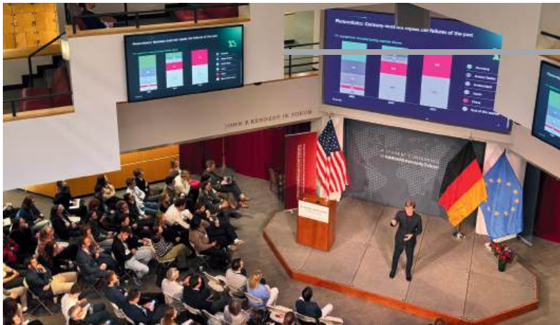
Keynote speech with BCG at the German-American Conference