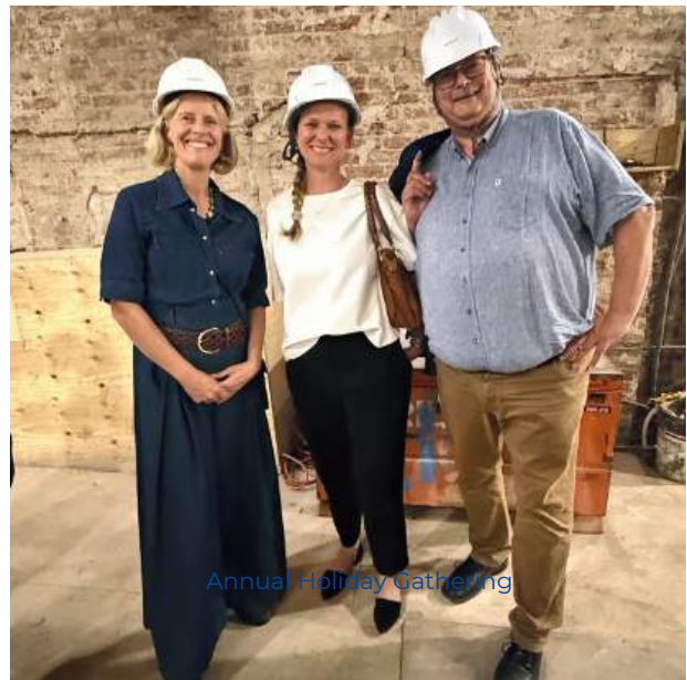
University Alliance Ruhr partner 1014 - Space for Ideas in construction