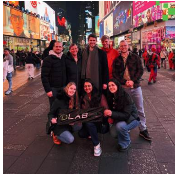
TUdo's DLAB students and faculty at Times Square

UA Ruhr participated in DAAD's Indo-German Science Forum and in the international conference APAIE 2025, which brought together educators from across the world under the theme of Cultivating Global Citizens for the Future. Both platforms provided valuable opportunities to exchange ideas and explore the evolving landscape of international higher education, while strengthening UA Ruhr's partnerships and visibility within India's growing academic and innovation ecosystem.