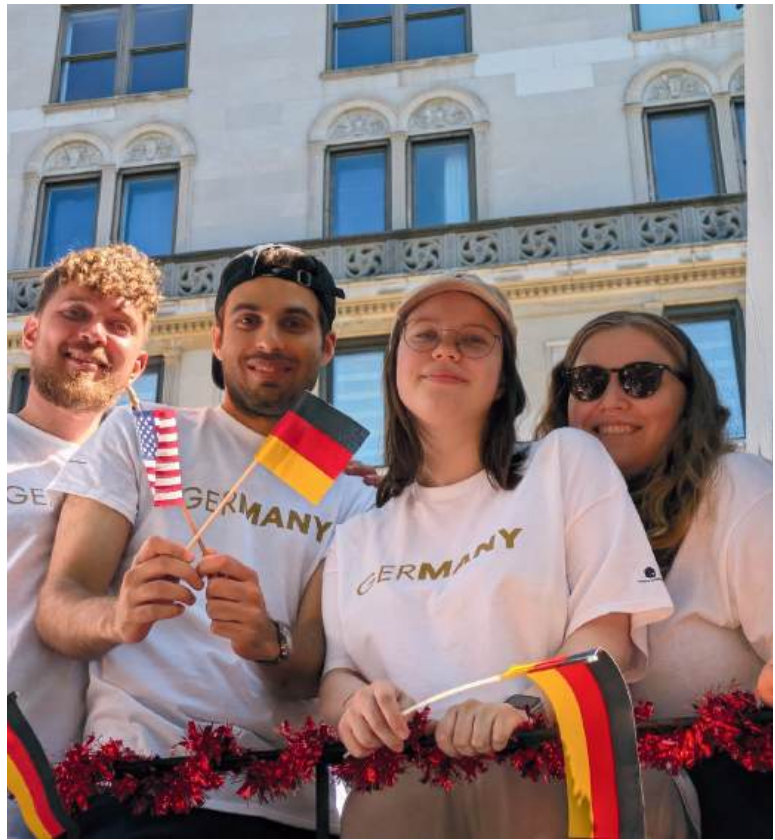
TRF 2025 at the Steuben Parade