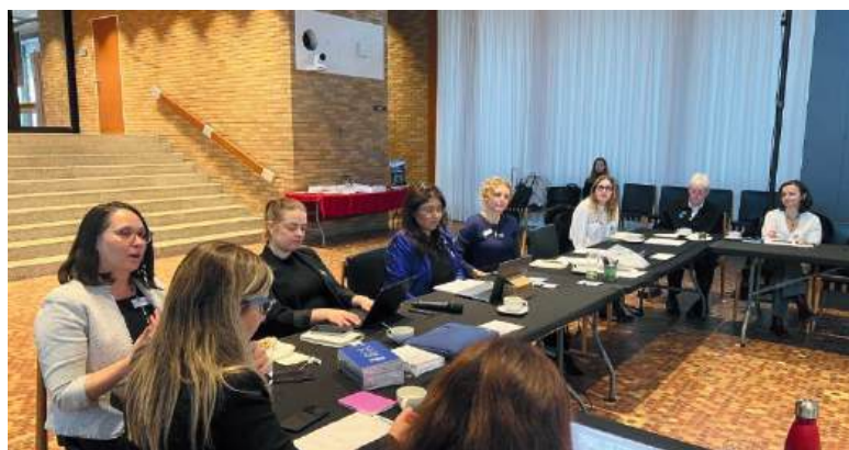
UA Ruhr co-leading the roundtable discussion at the German Embassy in Washington, DC

Held in honor of the UN International Day of Women and Girls in Science, the UA Ruhr roundtable was part of a weeklong series supporting women working in science organized by the Women in Science Diplomacy Association (WiSDA).