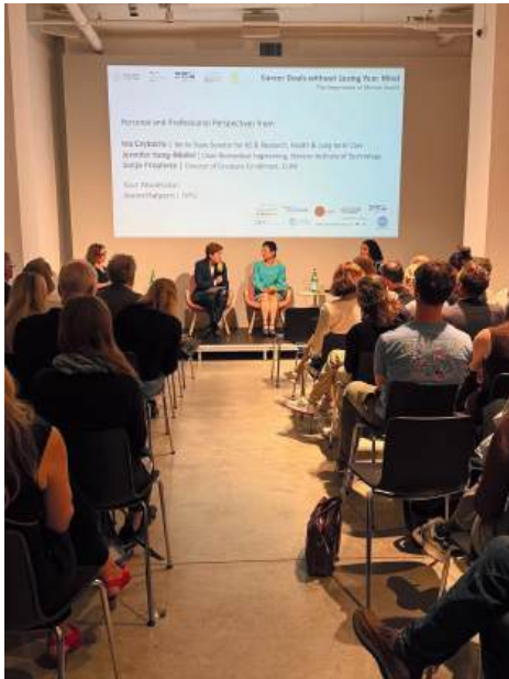
Make Germany a Part of it! Mental Health And Your Research Career at the Goethe-Institut