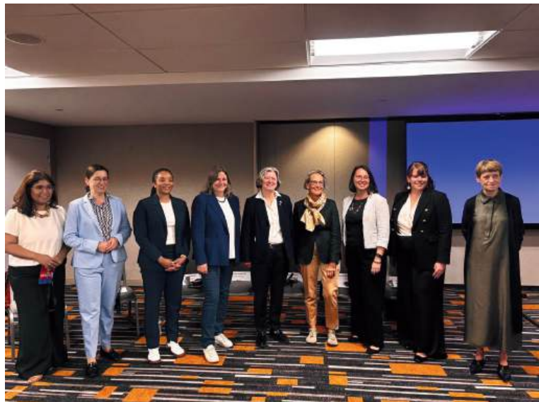
Leading with Excellence Workshop Panel at GAIN 2025 Annual Conference in Boston