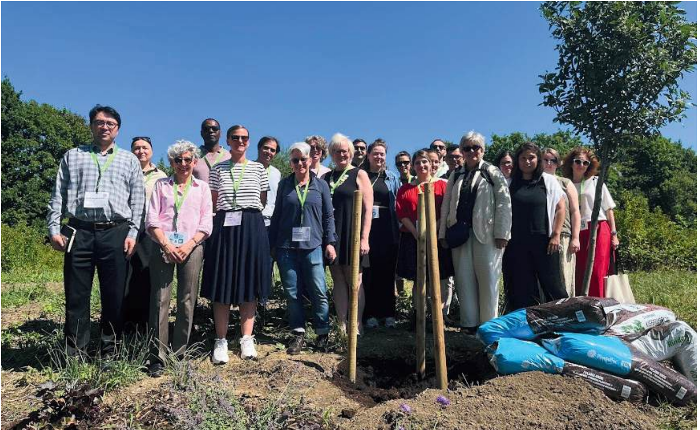
Garden(s) of Refuge, Academy in Exile, TU Dortmund, University of Michigan