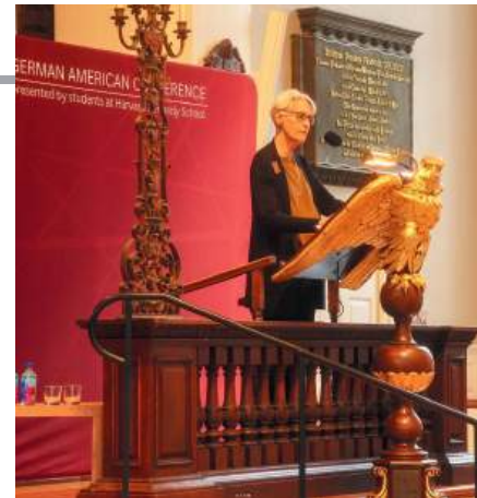
Ambassador Wendy R. Sherman