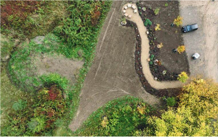
Garden(s) of Refuge in Dortmund