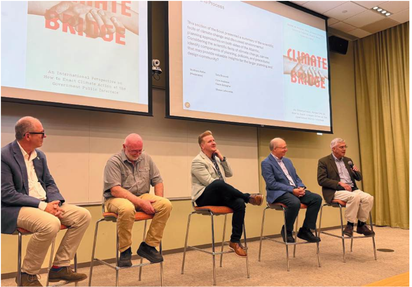
Climate Bridge at Rutgers University