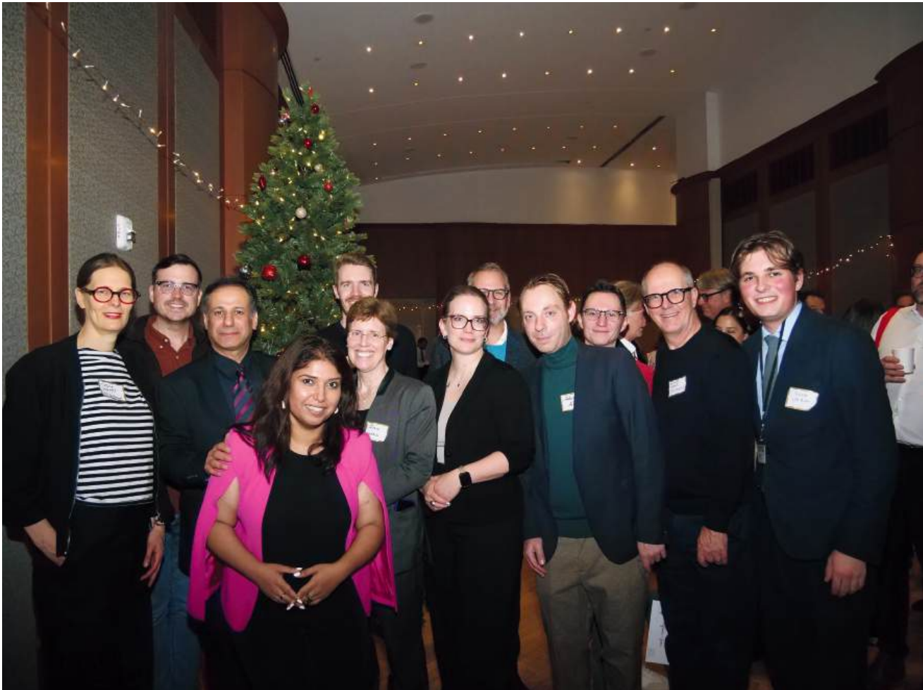
UA Ruhr friends, alumni, and colleagues at the Annual Holiday Gathering

UA Ruhr, together with the German Consulate General in New York and the German Universities Liaison Offices, hosted the annual alumni and partner holiday gathering, known for nostalgic singing and comforting Glühwein!