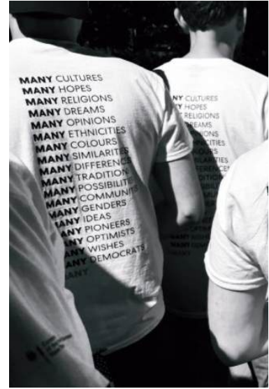
Steuben Parade 2025