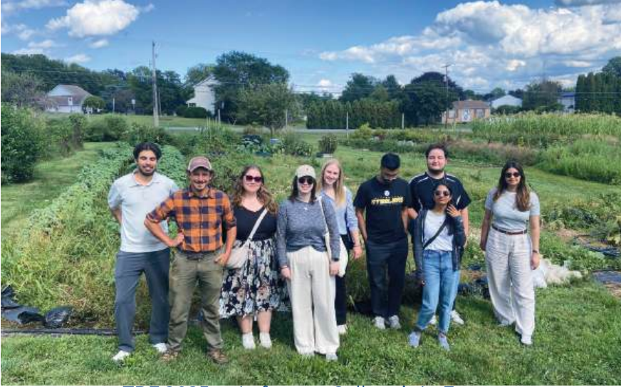
TRF 2025 at Lafayette College's LaFarm