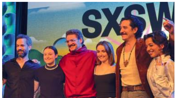
South by South West Austin