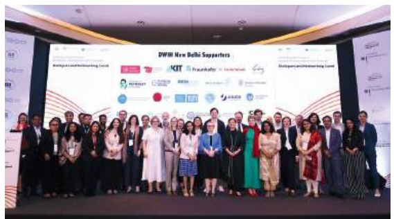
DAAD DWIH India