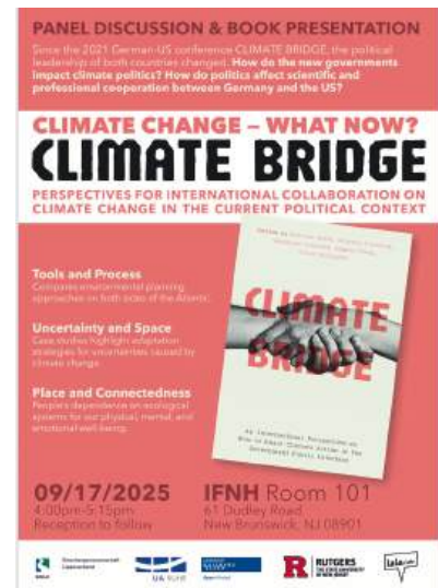
Climate Bridge at Rutgers University

University Alliance Ruhr participated in the presentation of Climate Bridge at Rutgers University in New Brunswick, NJ, on September 17, 2025. Hosted in cooperation with Rutgers University and Emschergenossenschaft, the event launched the new Rutgers University Press publication and brought together experts from Germany and the United States to discuss pathways for renewed transatlantic climate cooperation. Building on the original 2021 Climate Bridge conference, the conversation examined how evolving political landscapes in both countries shape climate policy, public engagement, and future collaboration toward sustainable, coordinated action.