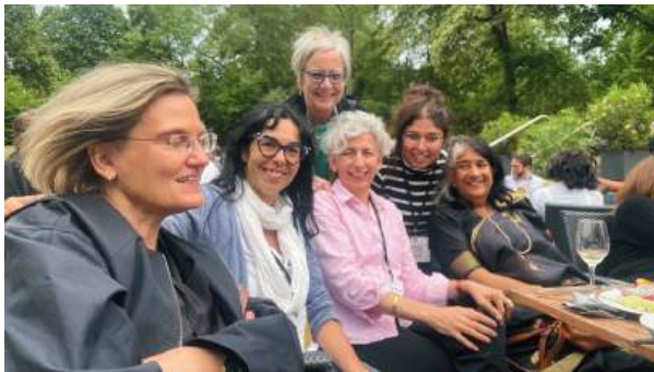
CHCI 2025 with Academy in Exile and Univ. of Cincinnati