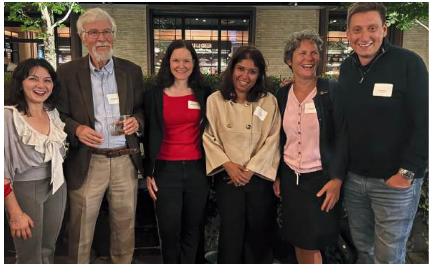
Unis and Us: German Alumni