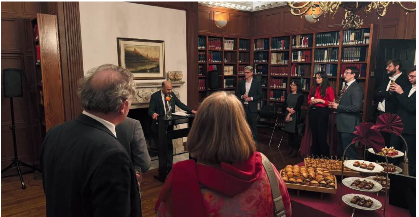
DAAD Partners and Friends Reception in Washington, DC