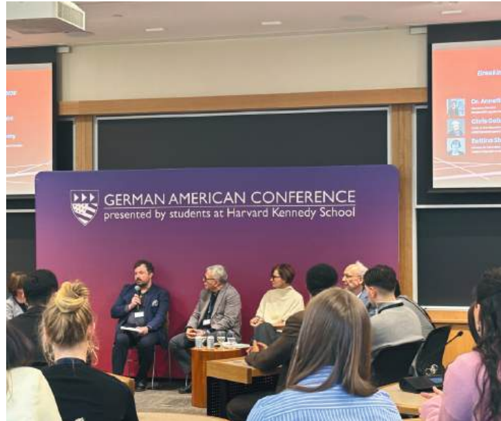
“Breaking the Bias: Equitable Education by 2030” at the German-American Conference 2025