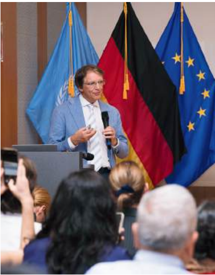
UA Ruhr Science Symposium