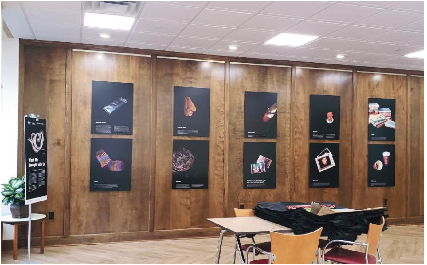
University Alliance Ruhr Exhibition at Duquesne University