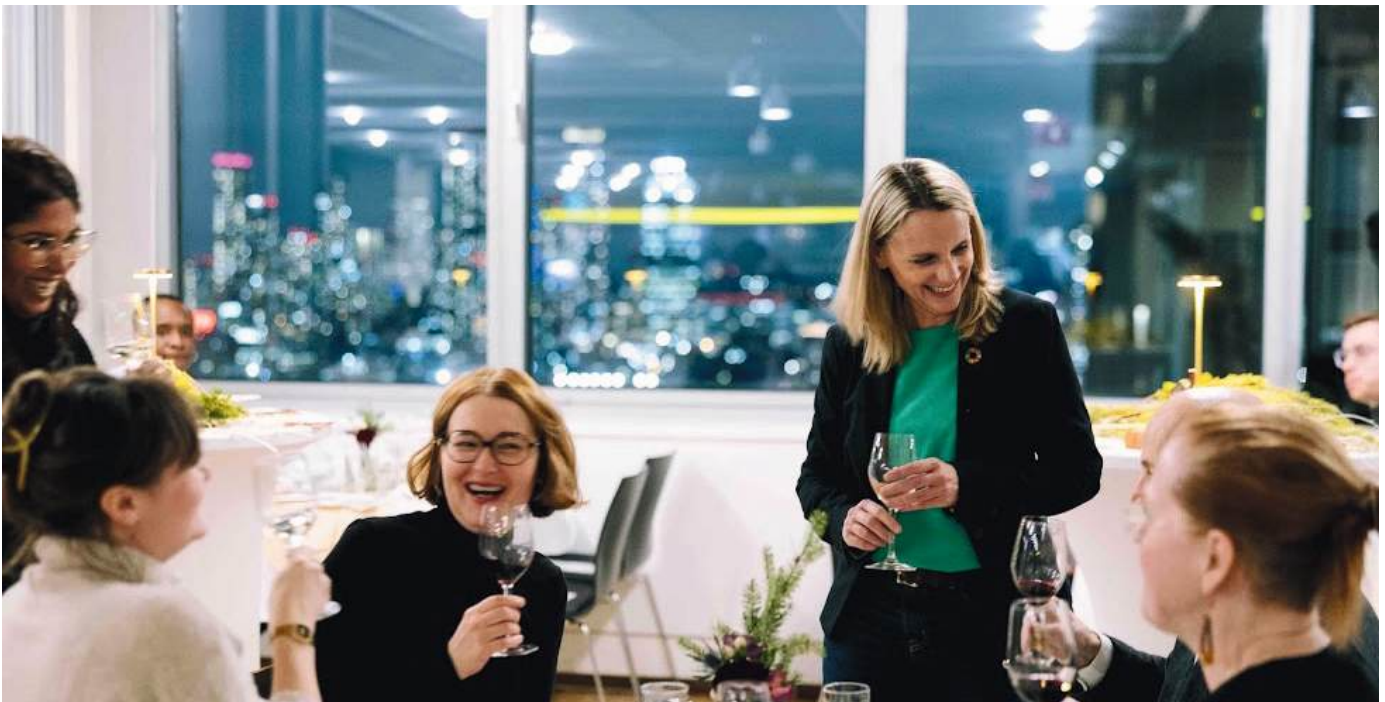
Once Upon a Bite