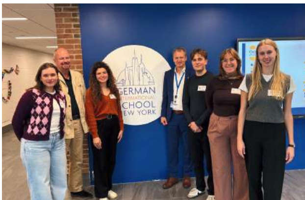
German School New York Info Session

University Alliance Ruhr participated in the Career Booster German(y) fair hosted by the Goethe-Institut New York, a full-day event designed to help high school and college students explore how learning German and gaining intercultural experience can open doors to study, work, and internship opportunities in Germany.