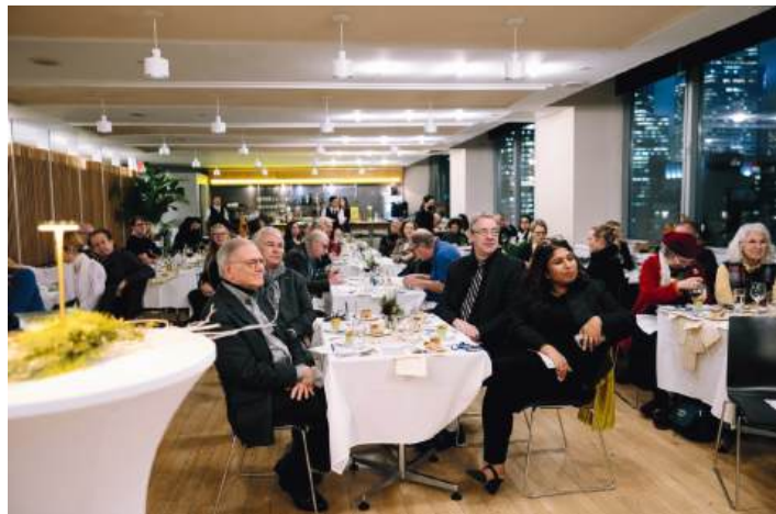
Once Upon a Bite