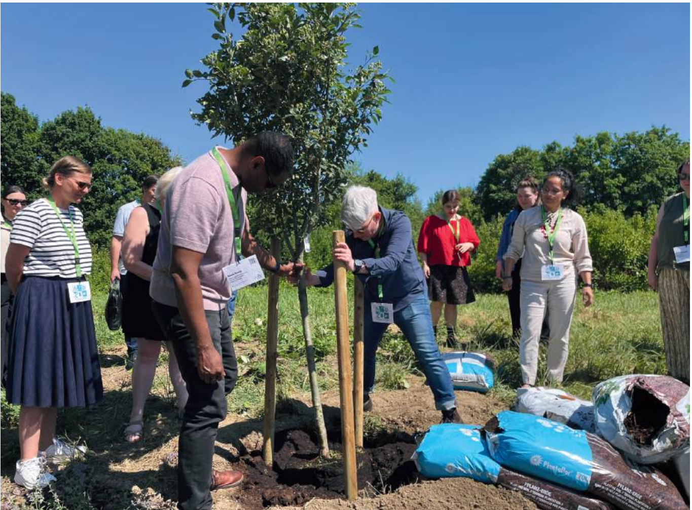
Garden(s) of Refuge, Academy in Exile, TU Dortmund, University of Michigan