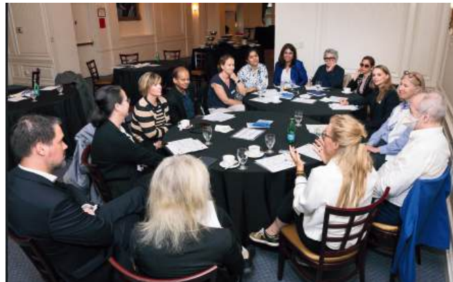
Dynamic panel and roundtable workshop on SCALEability

On June 25, 2025, UA Ruhr and Academy in Exile hosted the third iteration of the Transatlantic Working Group for At-Risk Scholars during the CHCI conference at Free University of Berlin. The program consisted of panels that focused on security and sustainability aimed to further transatlantic collaboration to support scholars facing threats to academic freedom.