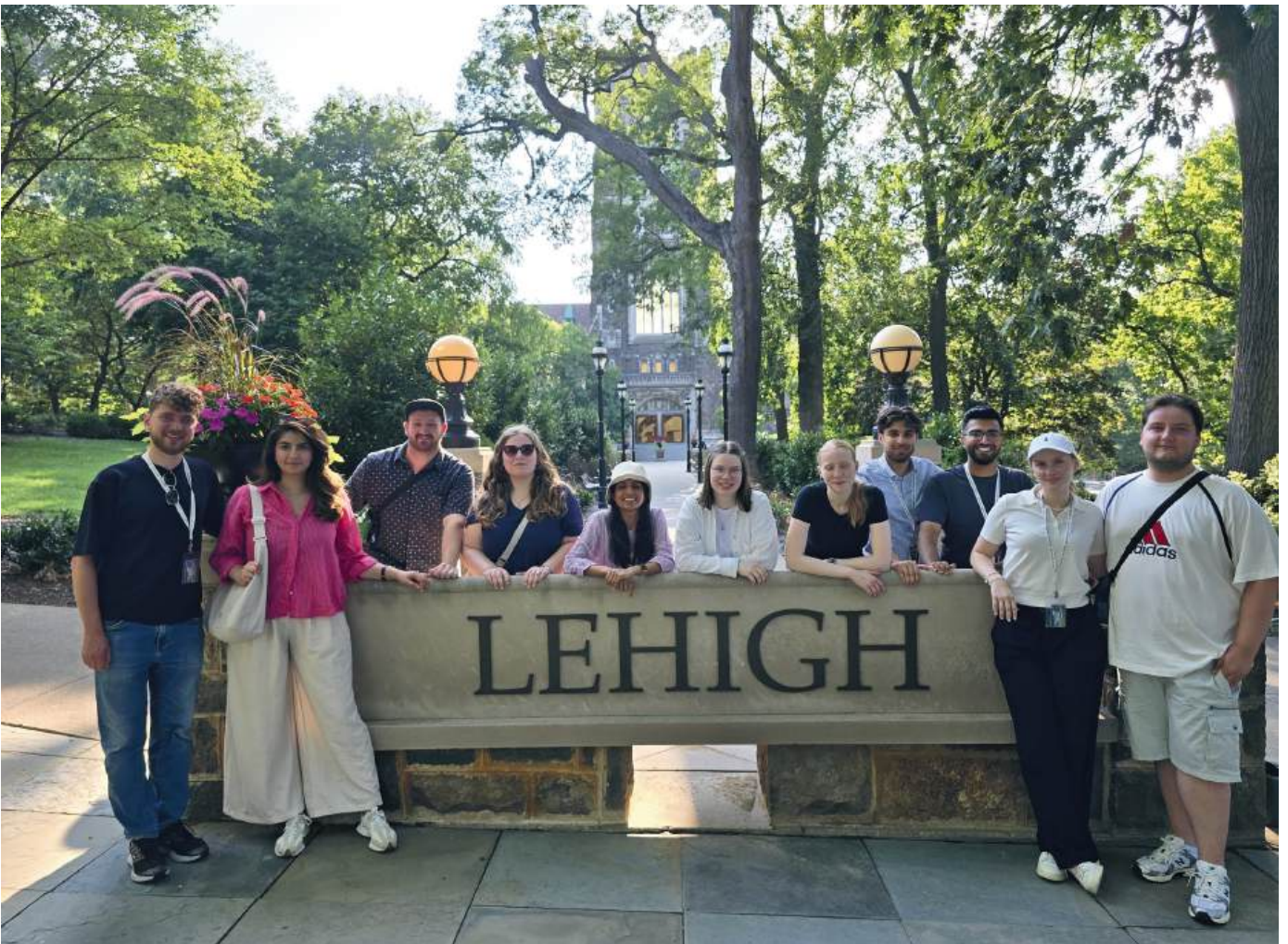
TRF 2025 Cohort at Lehigh University