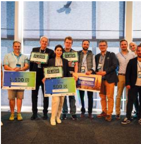
IDEA 2025 Pitch Contest in Bochum

WorldFactory International hosted IDEA 2025 at Ruhr University Bochum, bringing start-ups, researchers, and investors together. Through UA Ruhr and DWIH New York, the Pitch Contest winner was invited to the STEP USA University Program in New York City.