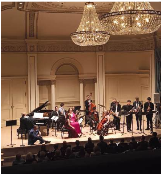
DAAD's annual "Sound Understanding Concert" at Carnegie Hall