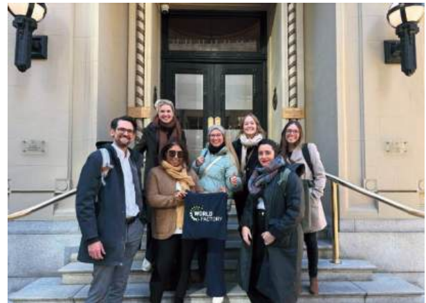
Innovation Bridge in Vancouver