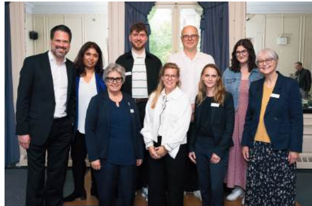
UA Ruhr, University of Duisburg-Essen, University of Virginia, 1014 - Space for Ideas, DWIH New York, NYU SPS