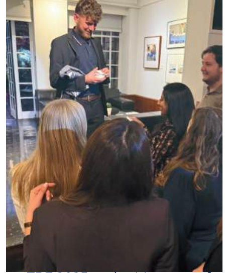
TRF 2025 at the Museum of Illustration Society of Illustrators