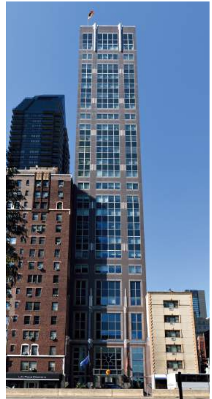
The German Consulate New York home of UA Ruhr North America