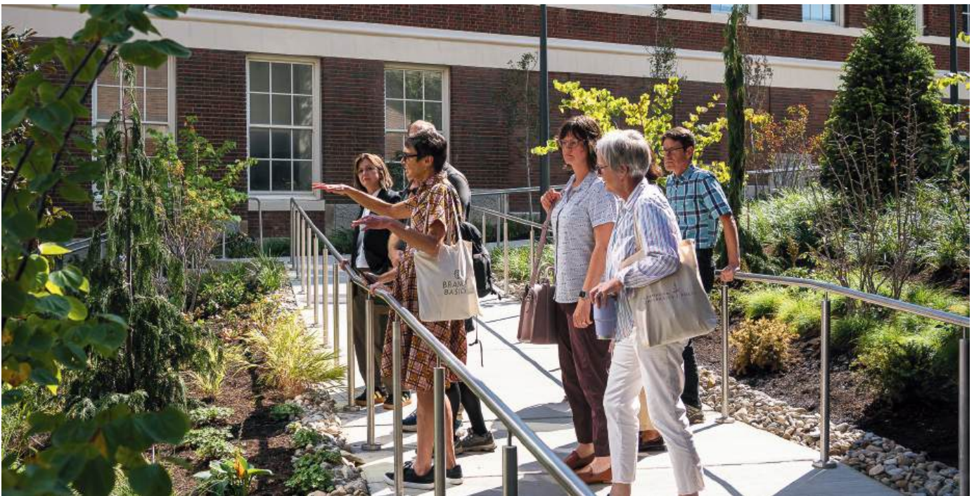
University of Cincinnati's Garden(s) of Refuge (work-in-progress)