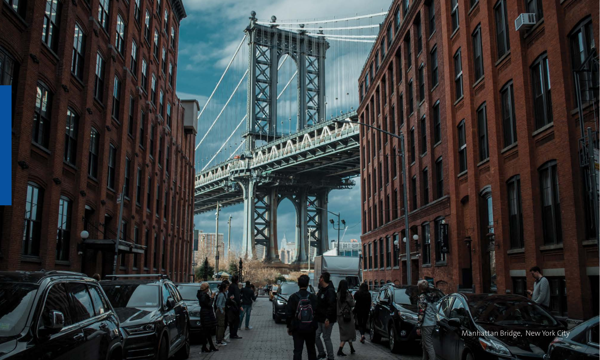
Manhattan Bridge, New York City