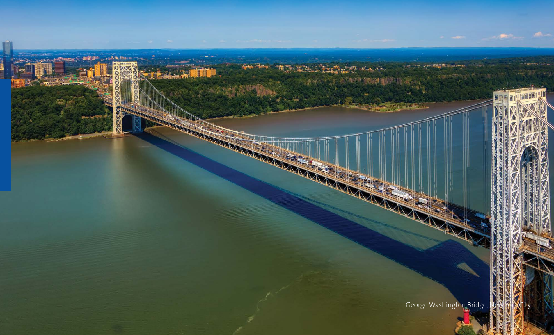
George Washington Bridge, New York City