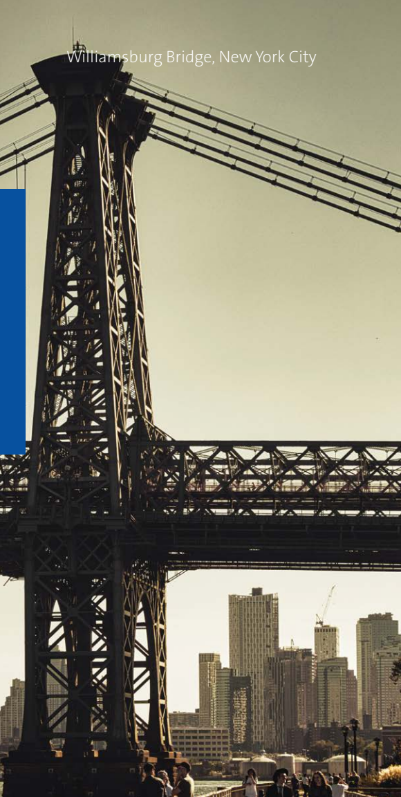
Williamsburg Bridge, New York City